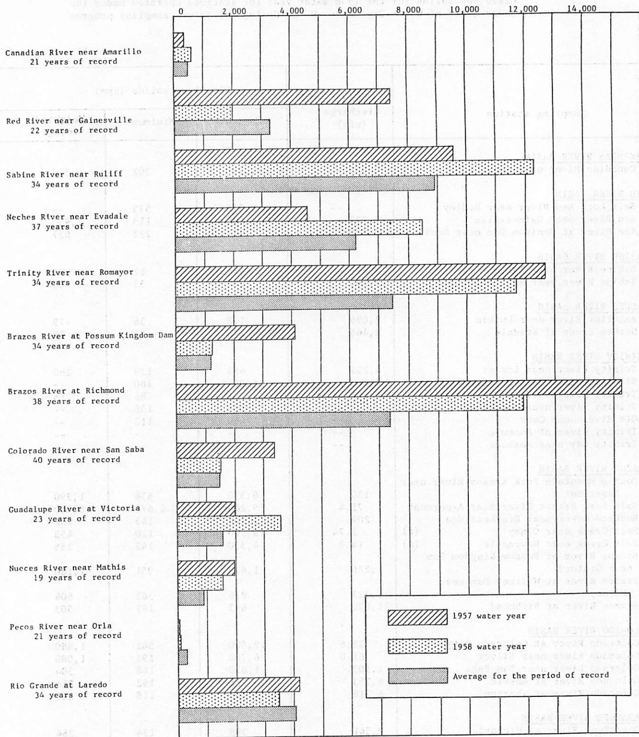
Figure 1.--Mean discharge at selected stations for the 1957 and 1958 water years and for the period of record.